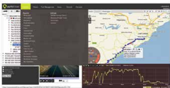
Online reports ranging from one line behaviour reports to detailed event reports.