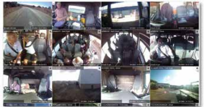
Online image dashboard, with images updating every 10 seconds.