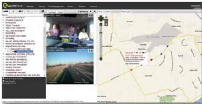
Current location with synchronised images, indicating location, heading, speed & event.