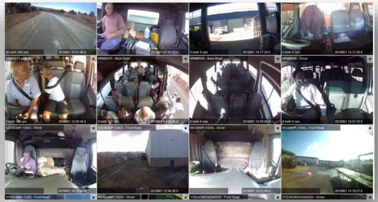
Online image dashboard, with images updating every 10 seconds.